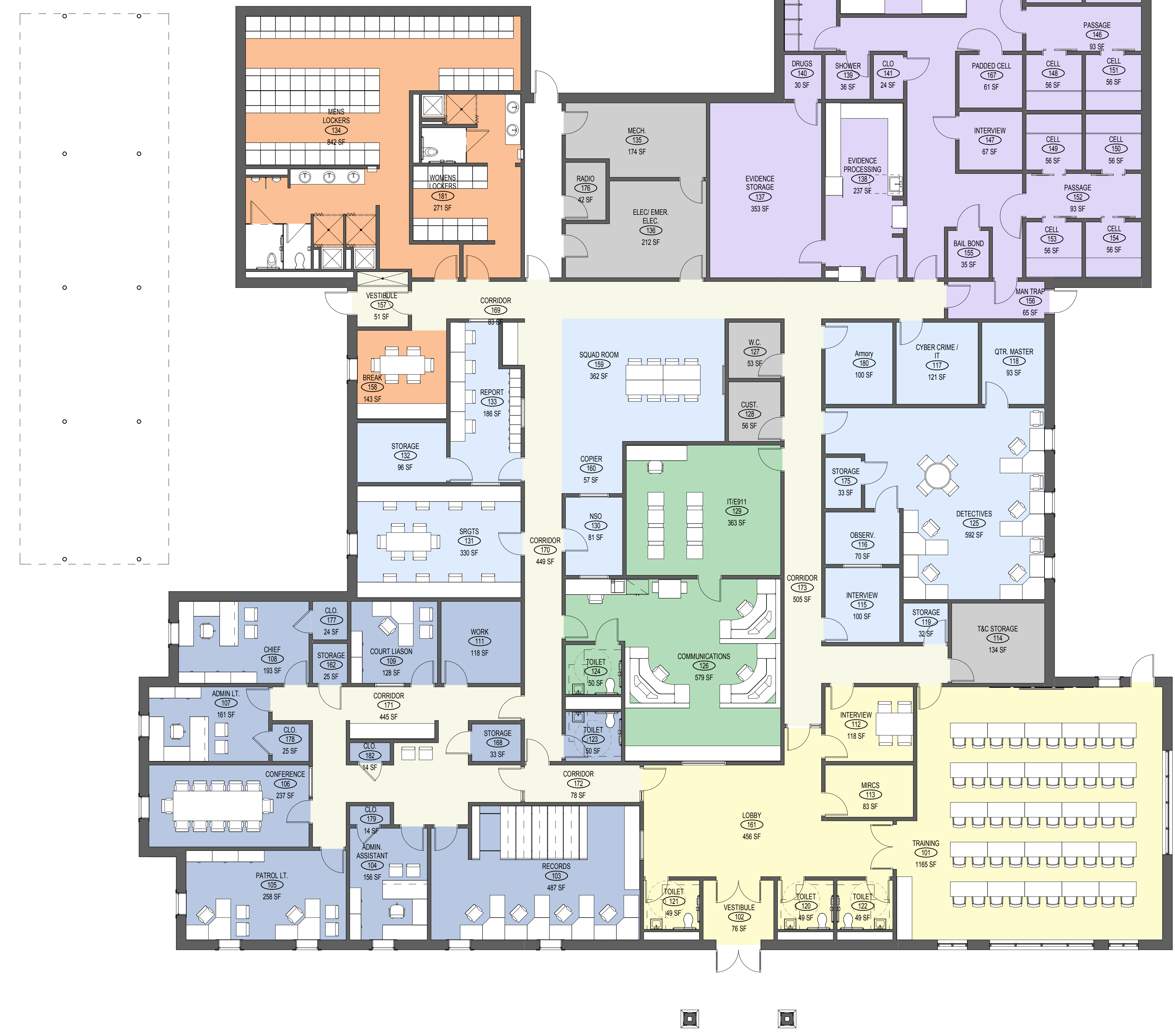
1 MAIN LEVEL - MAIN BUILDING 1/8" = 1'-0"