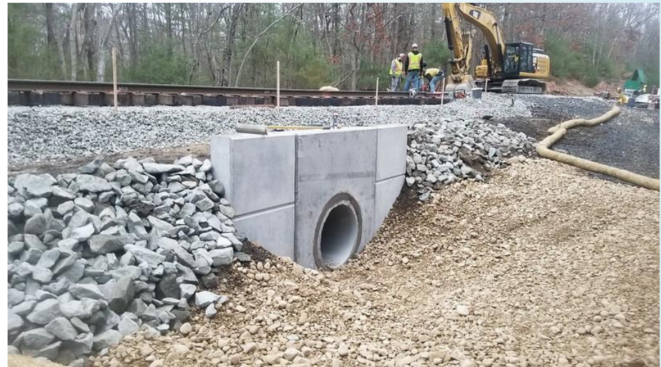
Lakeville track over new culvert